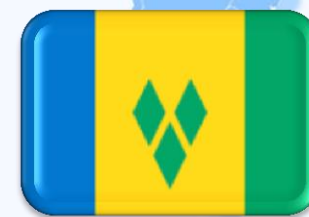
San Vicente y las Granadinas