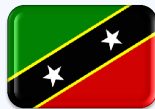
Saint Kitts y Nevis