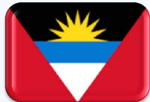
Antigua y Barbuda