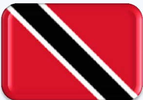
Trinidad y Tobago