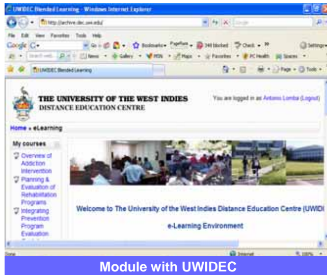
Module with UWIDEC